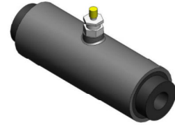
NOISE/SHOCK SUPPRESSOR REDUCES SOUND PULSATIONS IN HYDRAULIC LINES